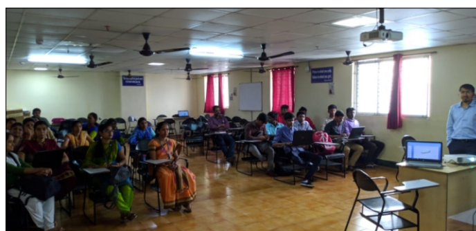
Second Level of Robotics Training Programme

Under the Centre of Excellence a Second Level of Robotics Training Programme was organized on 5 th and 6 th Jan. 19.