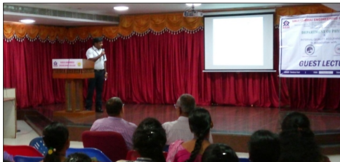
Guest Lecture on the 'New Engineering Materials'