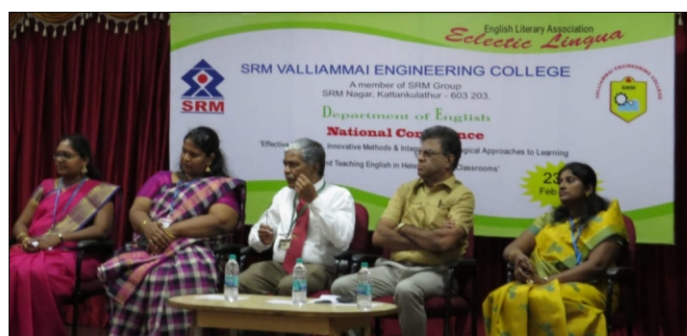
National Conference on 'Effective strategies, innovative methods and integrated pedagogical approaches to learning and teaching English in heterogeneous classrooms'