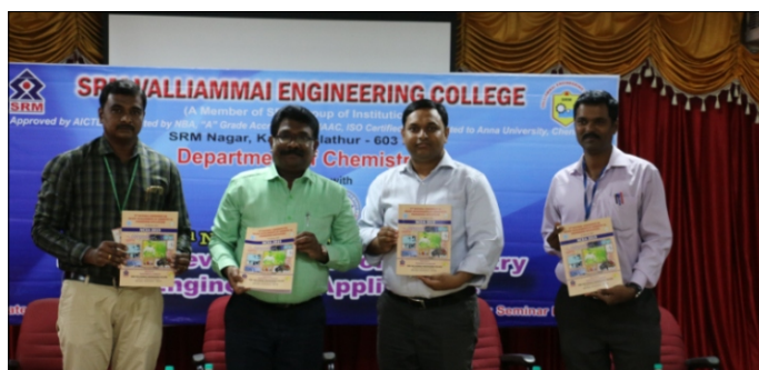
National Conference on the 'Recent Developments of Chemistry in Engineering Applications'