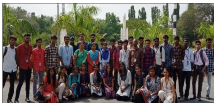
Industrial Visit to SDSC-SHAR [Sathish Dhawan Space Centre-Sriharikota]

Students of II Year CSE-2 went on an Industrial Visit to SDSC-SHAR [Sathish Dhawan Space Centre-Sriharikota High Altitude Range] on 12.02.2019.