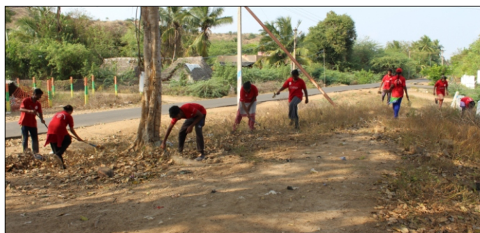
NSS Volunteers cleaning the area

National Voters' Day or Rashtriya Matdata Diwas is celebrated on January 25 every year. The significance of the National Voters' Day is to encourage more young voters to take part in the political process.