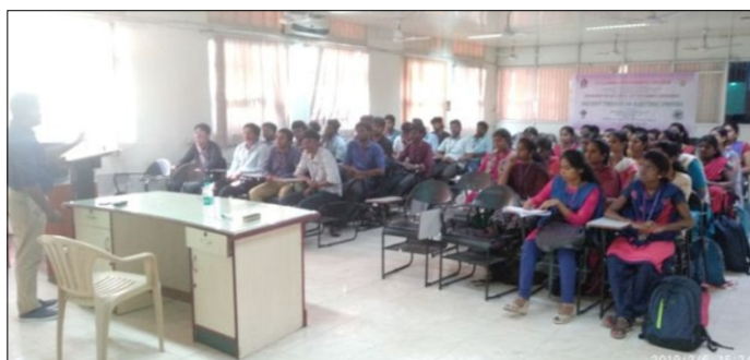
Seminar on the 'Recent Trends in Electric Drives'