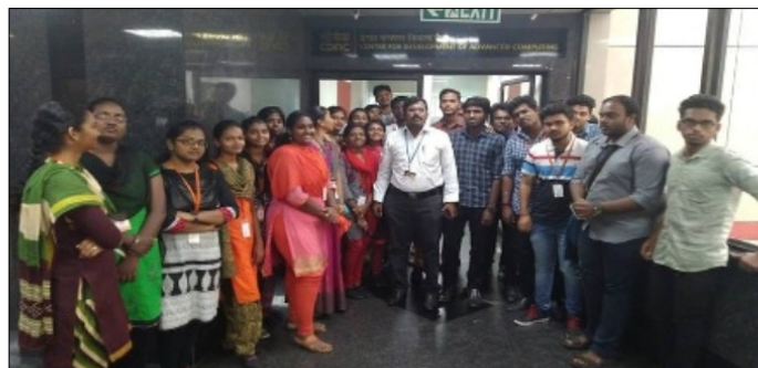
Industrial Visit to CDAC

Students of IV Year CSE-1 went on an Industrial Visit to CDAC on 01.02.2019.