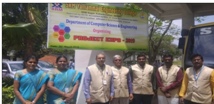
Project Exhibition Day for the Final year students