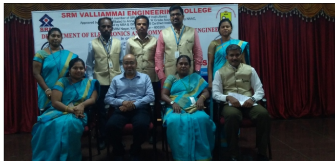
Workshop on the 'Advanced VLSI Design Tools'

The Project Expo 2k19 was conducted on 20.03.2019 as a part of the 'Student Best Project 2019' during the academic year 2018-19. Three projects were shortlisted based on various parameters such as social relevance, innovation, uniqueness, creativity and demo.