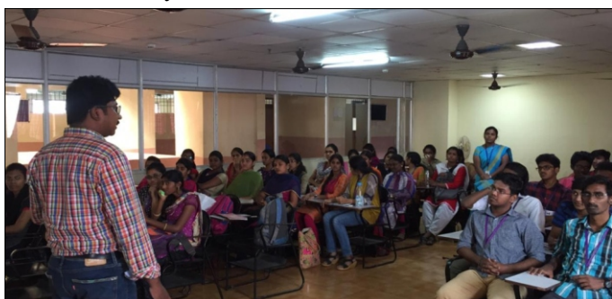
Seminar on the 'Higher Studies-Scopes and Benefits'