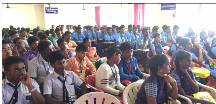
Workshop on 'Learn the Bot'

Under the Centre of Excellence, a workshop was organized on 'Learn the Bot' on 26.1.2019 for school students.