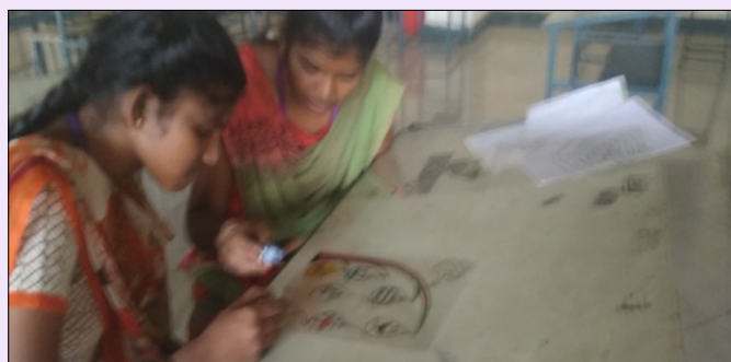
Poster competition to celebrate, the World Water Day