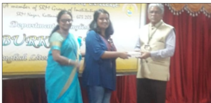
Oratorical Competitions under the auspices of 'Burke Club'