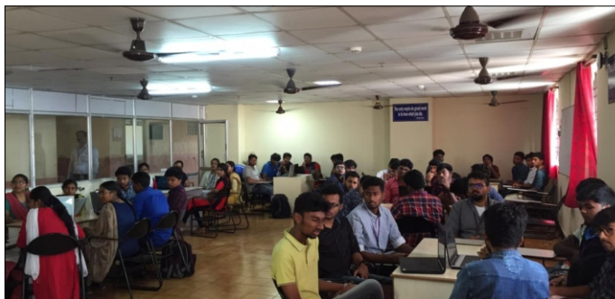
'Skill Development Program in Robotics'

Entrepreneurship Development Institute of India, Ahmadabad and National Science & Technology Entrepreneurship Development Board, DST, Govt. of India organized a three day Entrepreneurship program from 04 th to 06 th February 2019.