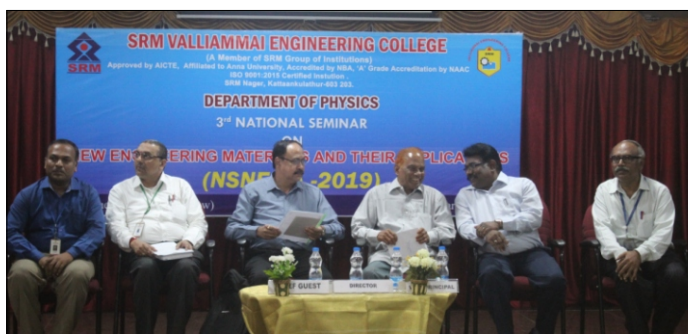
National Seminar on the 'New Engineering Materials and their applications'

The Department of Physics organized the 3 rd National Seminar on the 'New Engineering Materials and their applications' (NSNEMA-2019) on 23 rd March, 2019.