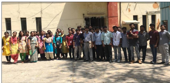
Industrial Visit to 'BSNL-DTTC, Chennai'

v. The 'BSNL-DTTC, Chennai' on 07.03.19 for the III year IT-1 students.