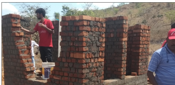
Construction of common toilets by SRM VEC NSS Volunteers

The NSS unit of Valliammai Engineering College organized a special camp at Ozhalur village, Chengalpattu, Kancheepuram District from 27.02.2019 to 05.03.2019. According to the Central Government scheme 'Unnat Bharat Abhiyan', NSS volunteers carried out the vision of transformational change in rural areas to help build the architecture of an inclusive India.