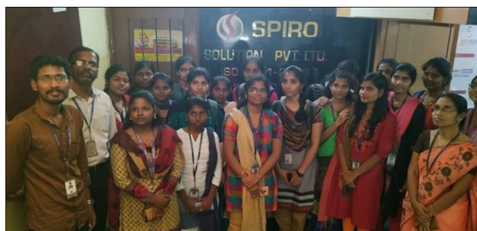
Industrial Visit to 'Spiro Technology'

Viii. The 'Spiro Technology, Chennai' on 07.02.19 for the II year IT-3 students.