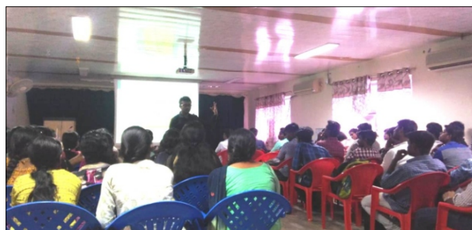
Guest Lecture on the 'Non-conventional Energy Resources'