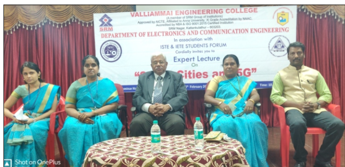
Seminar on the 'Smart Cities and 5G'