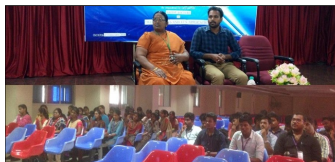
Guest Lecture on the 'Web Services and its Applications'