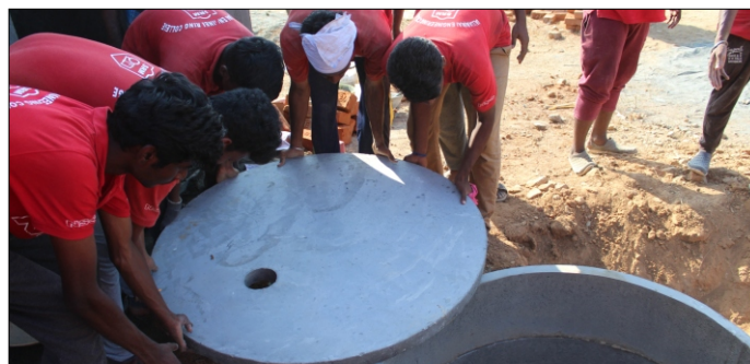
Rain water harvest pit

The camp ended in a very useful way. At the end of the event, around 200 cloth bags were distributed to the residents of the apartments.