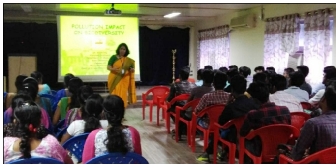
Guest Lecture on 'Pollution Impact on Biodiversity'