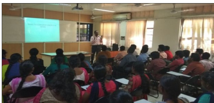
Workshop on the 'Energy Conservation and Issues towards Cleaner Environment'