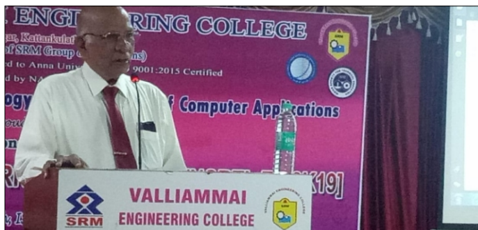
Guest Lecture on the 'Applications of Queueing Theory'