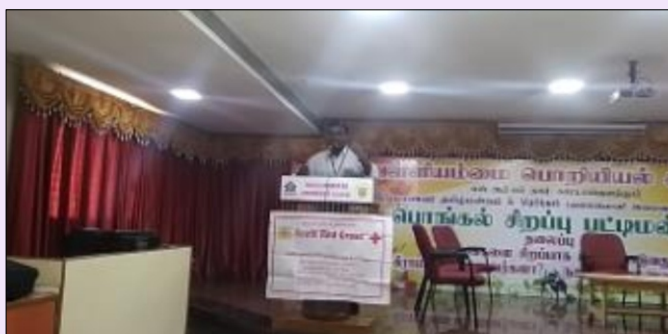
Oral Competition on Youth day

An Oral Competition on the Youth day was conducted on 10.01.19. The program started at 4.00pm, with the introduction to the competition and later, Swami Vivekananda, the great philosopher's ideals were highlighted. The speakers spoke on the 'Youth Potential'. Finally, the gathering was asked to identify their own unique potential and to optimize it. The prize winners were awarded their prizes on the occasion of the Republic Day, 26.01.19.