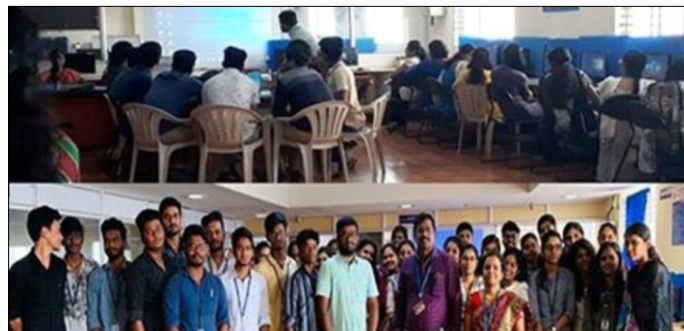
Workshop on 'Natural Language Technology'

A one day workshop was conducted on 'Natural Language Technology' on 05.02.19.