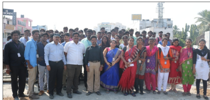
EAC factory visit at Grade Separators

EAC factory visit at Grade Separators on the Velachery Main Road.