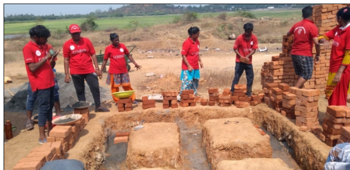
Construction of Common Toilet

project for this camp was based on making the village Ozhalur free from open defecation, by constructing four communal toilets near a stone mine where most of the civilians cannot afford a toilet of their own, then to construct a water rejuvenating soak pit and to clean the bank of pond.