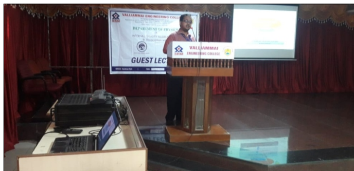
Guest Lecture on the 'Recent Trends in Surface Engineering'