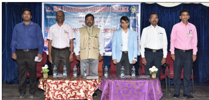
National Seminar on Emerging Technologies in Mechanical Engineering