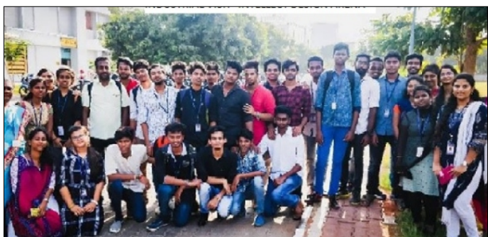
Industrial Visit to the Intellect Design Arena

Students of II Year CSE-3 went on an Industrial Visit to the Intellect Design Arena on 22.03.2019.