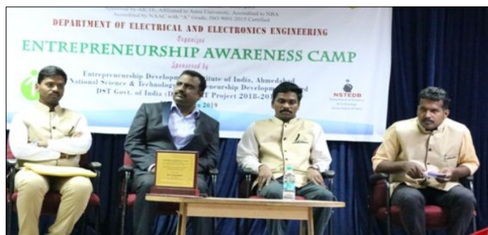
Entrepreneurship Awareness Camp (EAC)