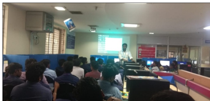
Value Added Course on the 'Analysis Software Using STADD Pro'