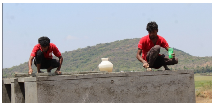
Construction of Common Toilet