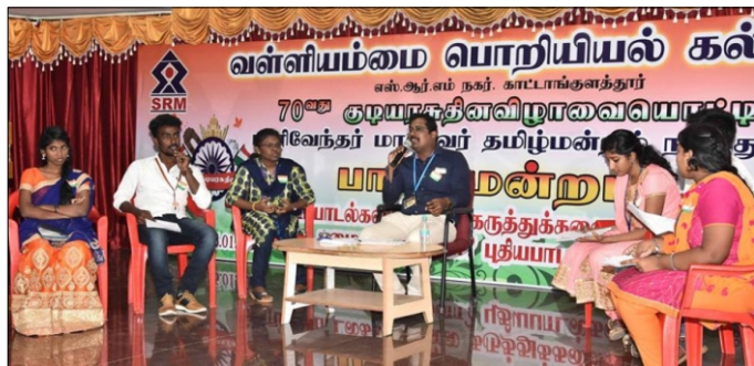
Pongal pattimandram on the topic 'Who celebrates the festivals in a grand manner Rural students or Urban students?'