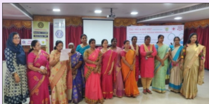
Awareness camp on Rubella, Women Wellness and Women Students