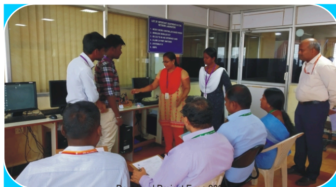
Dept level Project Expo 2020