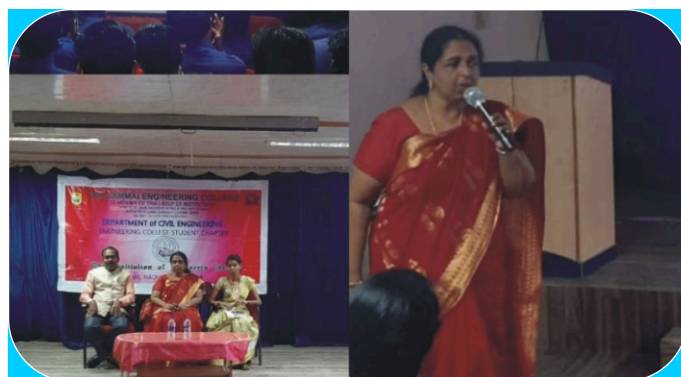
Guest Lecture in 'Improvement techniques in Soil Structure'