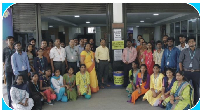
'Wheat Bucket' collection drive organised by 'MANASSO'

As a part of the Institution Social Responsibility drive, the MBA Students club 'MANASSO' organised a 'Wheat Bucket' collection drive. Students, teaching and non teaching staff of the institution donated 800 kilograms of Wheat that was distributed to 6 orphanages and old age homes.