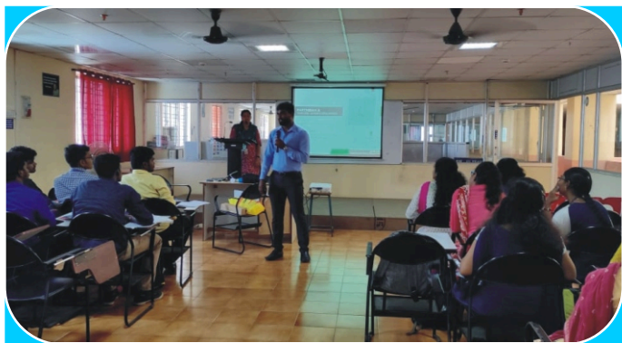
Workshop on the 'Emerging Trends in Industrial Automation'

The Dept. in association with the ISA VMEC Student Charter and ISTE, Entrepreneurship Development Institute of India, Ahmedabad and National Science & Technology Entrepreneurship Development Board, DST, Govt. of India organized a three - day Entrepreneurship programme from 11 th to 13 th February 2020.