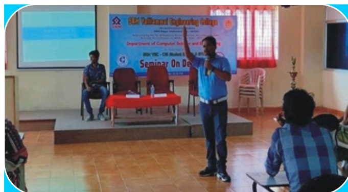
'Dev Ops Software Development(Dev) and Information Technology Operations (Ops)'