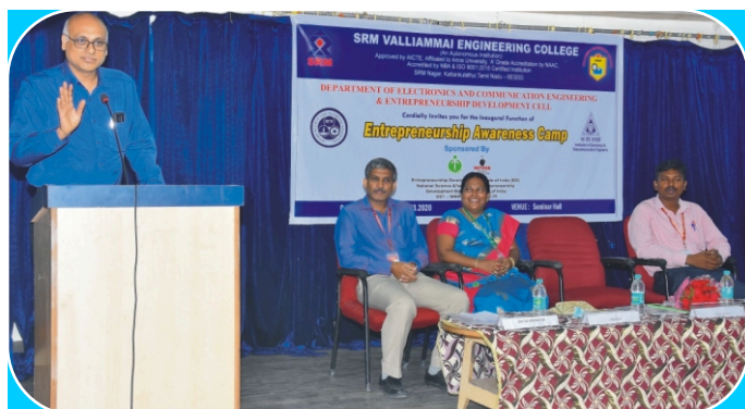
Entrepreneurship Awareness Camp (EAC)