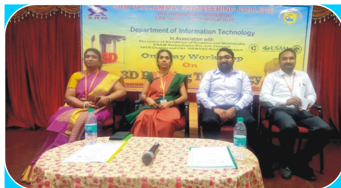
Workshop on '3-D Printing Technology'