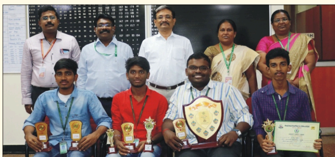
Tamil competitions conducted by Pachiyappa's college and won the over all trophy