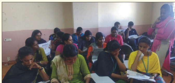
Value Added Course on 'TV News Reading and anchoring Training in Tamil'