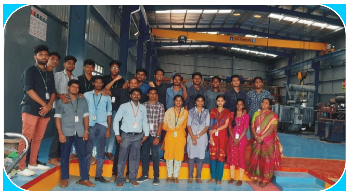
Industrial Visit to Sakthi Transformers, Thirumudivakkam, Chennai

The Second Year U.G students visited Sakthi Transformers, Thirumudivakkam, Chennai on 22 nd February 2020.