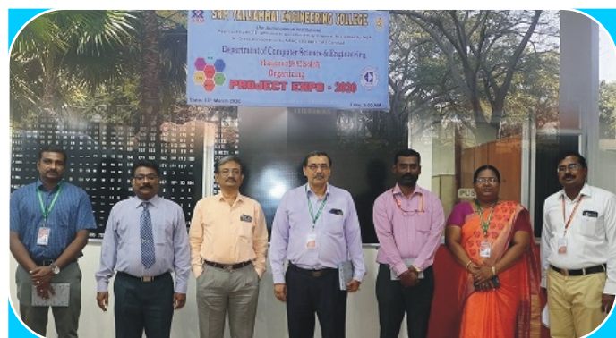
Project Exhibition Day