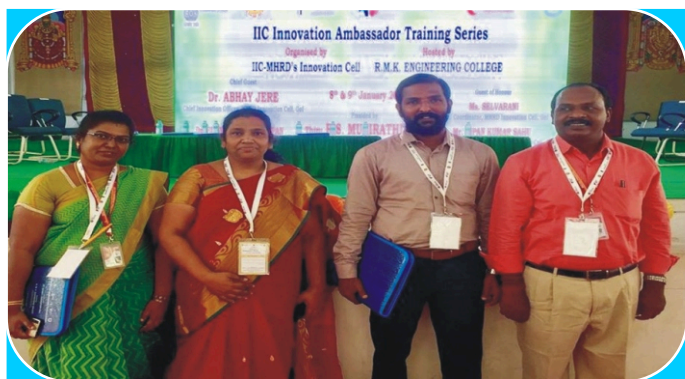
'Innovation Ambassador Training Series Program'

Thinking and Innovation, Entrepreneurship Development Program, IPR and Technology Transfer and Pre-incubation and Incubation Management.