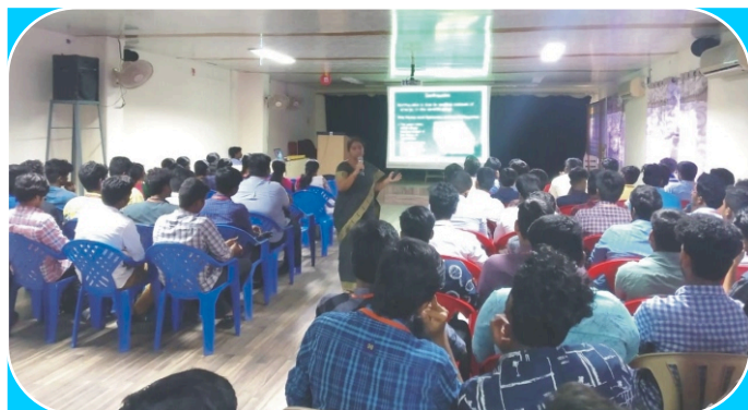
Guest Lecture on the 'Disaster Management'