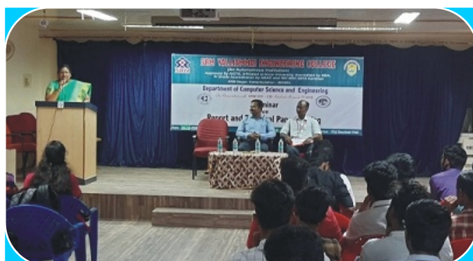
Seminar on 'Report and Technical paper writing'