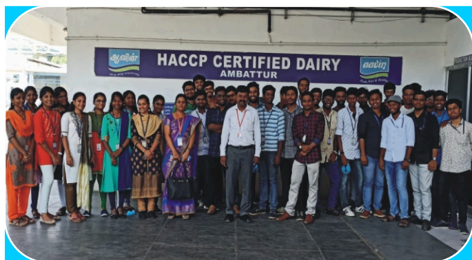
Industrial Visit to Aavin Milk Processing Plant, Ambattur

The Third Year U.G students (Section-2) visited Aavin Milk Processing Plant, Ambattur on 14 th February 2020.