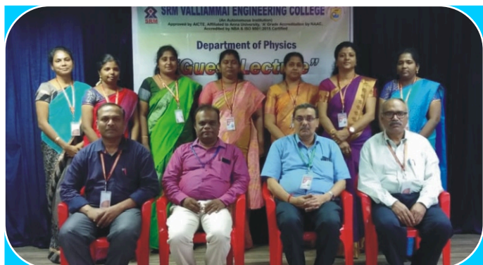
Guest Lecture on 'Recent Trends in Optoelectronic Devices'