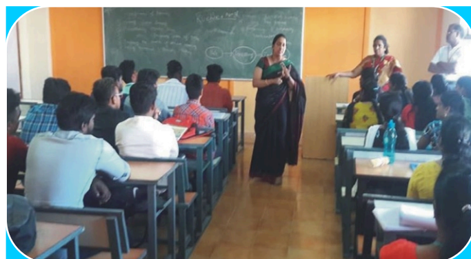
Alumni talk for the First Year MBA Students