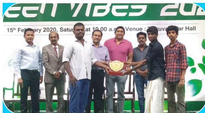
Won the Overall Trophy in the Inter College Tamil Drama Competition