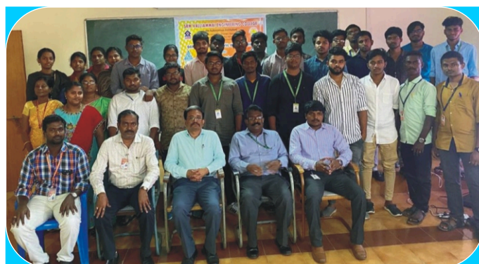
Workshop on 'Software Applications in Civil Engineering'

Department of Civil Engineering conducted a Value Added Course on 'Analysis Software Using STADD Pro' from 5 th February to 26 th February 2020. The course was handled by Mr.G.R.Iyappan/AP. 45 students had enrolled in this course.