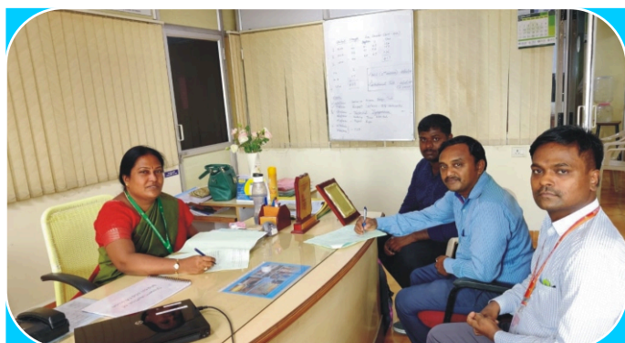
MoU with PanTech Solutions Pvt Ltd (Pantech Prolabs India), Chennai