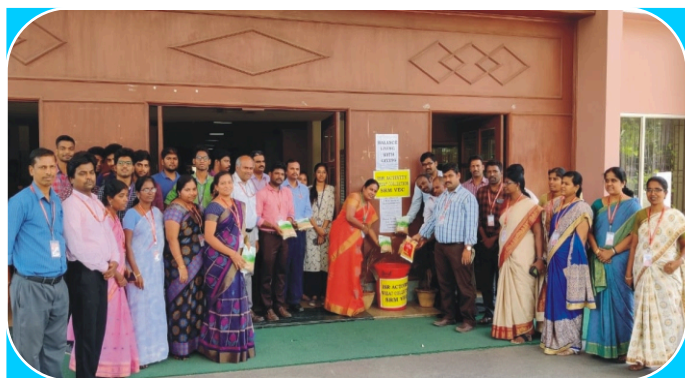
Wheat donation to orphanage

As a part of Institutional Social Responsibility (ISR) activity, the faculty members and students donated wheat to orphanage.