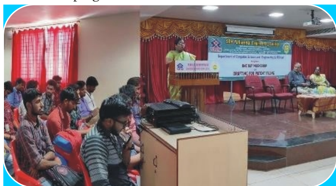
Workshop on 'Drafting for Patent Filing'

IPR Cell, in association with Computer Society of India organized a Workshop on 'Drafting for Patent Filing' on 8 th January 2020. Shri. T. V. Madhusudhan, Former Deputy Controller of Patents and Designs, Intellectual Property Office, was the chief guest for the programme and he spoke on Patent Drafting and Filing . Around 104 participants from various departments including students, faculty members attended the programme.