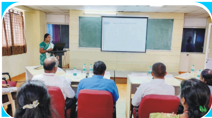
Board of Studies meeting with External and Internal BOS members