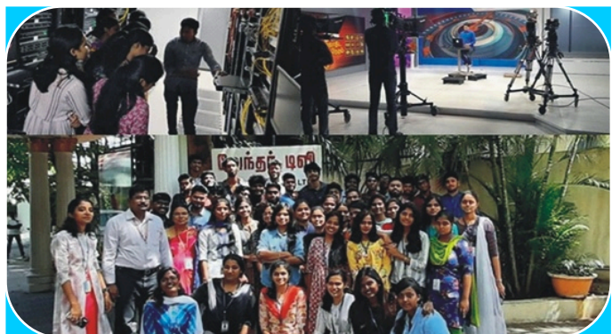
Industrial Visit to Vendhar TV

Students of III Year CSE-1 went on an Industrial Visit to Vendhar TV on 21 st February 2020.