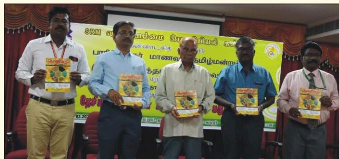
Release of Quarterly Bulletin 'Poriyari'

The Tamil Computing syllabus has been introduced in our college in order to raise awareness in Tamil Computing.