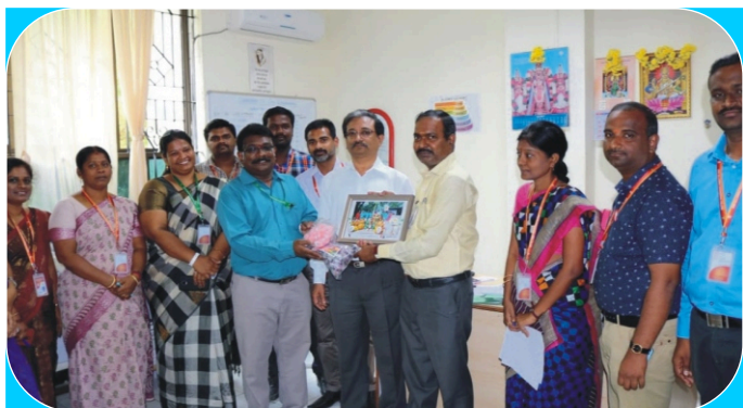
Won 'Best Picture' in Pongal Celebrations

Department of Civil Engineering actively participated in the Pongal Celebrations held in the college and won 'Best Picture' in the group picture contest.