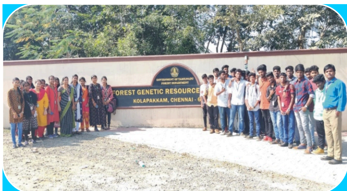
Industrial Visit to State Forest Research Institute (SFRI), Chennai