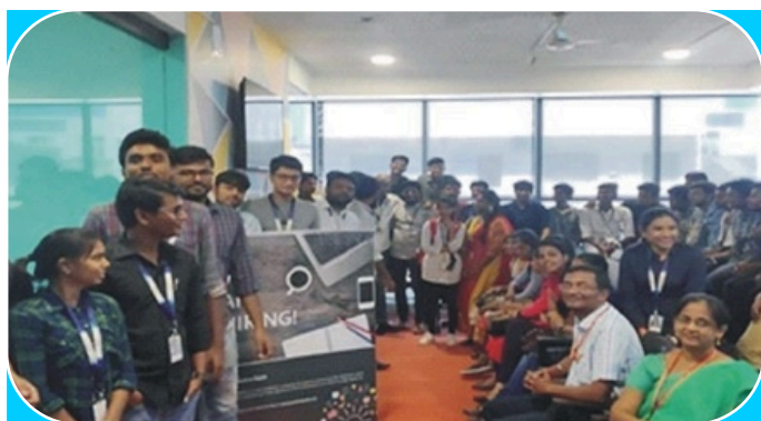
Industrial Visit to Positive Naick Analytics, Chennai

Students of III Year CSE-1 went on an Industrial Visit to Vendhar TV on 21 st February 2020.