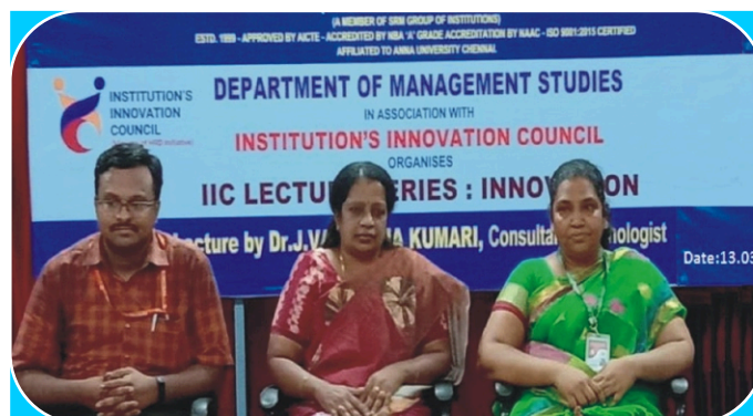
IIC Lecture Series : Innovation