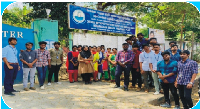
Industrial Visit to Waste Water Treatment Plant, Koyambedu and Nesapakkam

The Third year Civil Engineering students (III-B Sec) went on an industrial visit to Waste Water Treatment Plant, Koyambedu and Nesapakkam on 25 th February 2020. The students were divided into two batches.