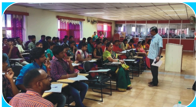
Guest Lecture on 'Application of Random Processes'