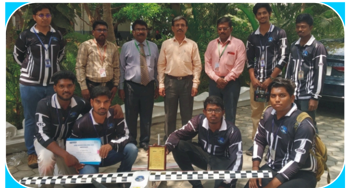
First position in technical presentation

A Three - day SAE ADC-2020 Final event was held at Bannariamman Institute of Technology, Sathyamangalam from 28 th Feb to 1 st March 2020. Our team successfully completed the registration technical inspection and got approval for the flying round. With a payload of 2.625 kg, our airplane model took off and landed successfully after completing three consecutive laps in air. Our team got the first position in technical presentation out of 150 teams.