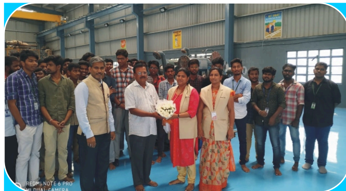
Industrial Visit to Sakthi Transformers, Chennai