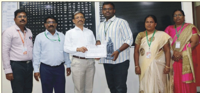
Speech Competition organized by Centre for Development of Tamil in Engineering and Technology, Anna University Chennai