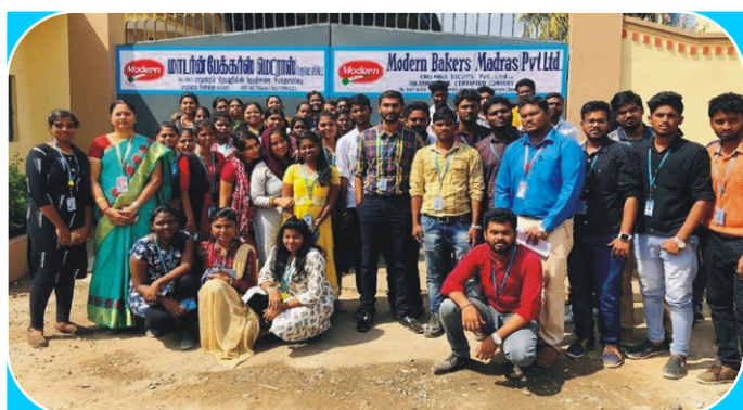
Industrial visit to M/s. Modern Bakers Madras Pvt. Ltd