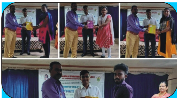
Students secured 'S Grade' in University Examination were awarded with books by HOD

Students who secured 'S Grade' in University Examination were awarded with books by the Head of the Department on 10 th March 2020.