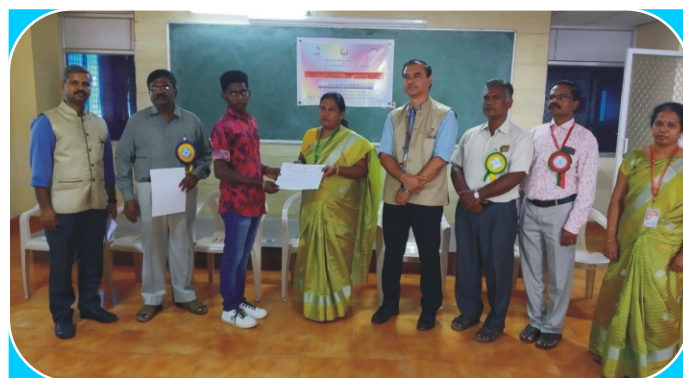
District Skill Competition-2019 in Electronics