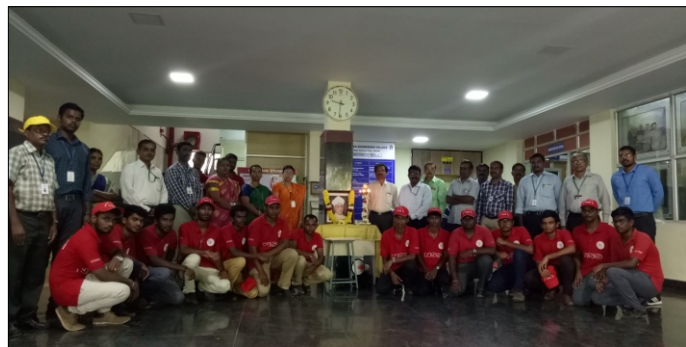
Teachers' Day Celebrations at VEC