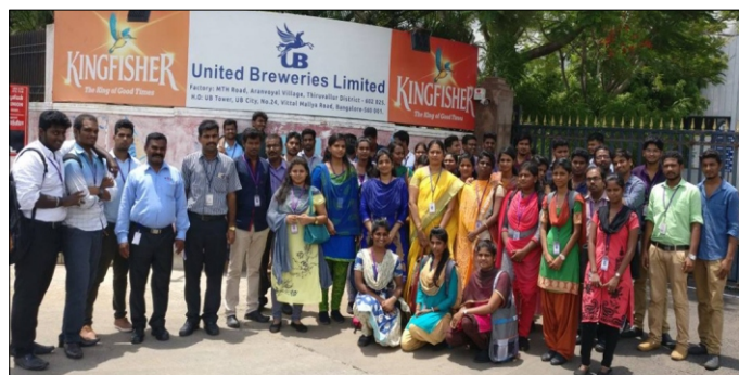
An industrial visit to the United Breweries Ltd, Chennai

An industrial visit to the United Breweries Ltd, Chennai was arranged for the Second Year MBA Students on 09.08.2017. The students had an opportunity to understand the business processes and the manufacturing operations carried out.