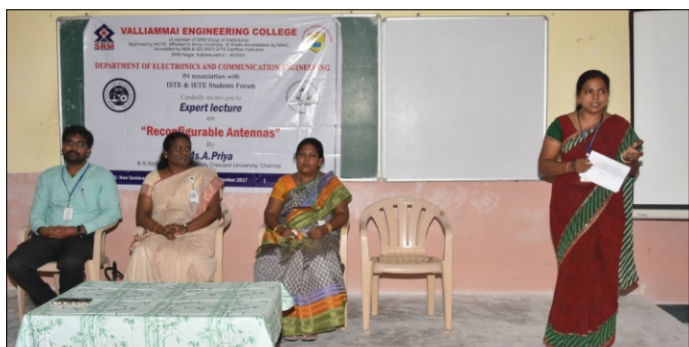
Expert Lecture on 'Reconfigurable Antenna'