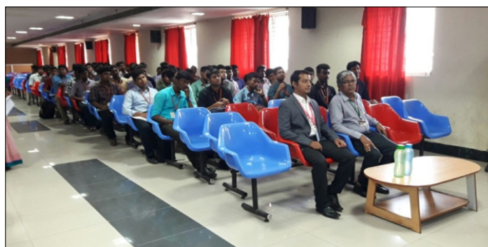
Workshop on 'Digital Writing Skills'