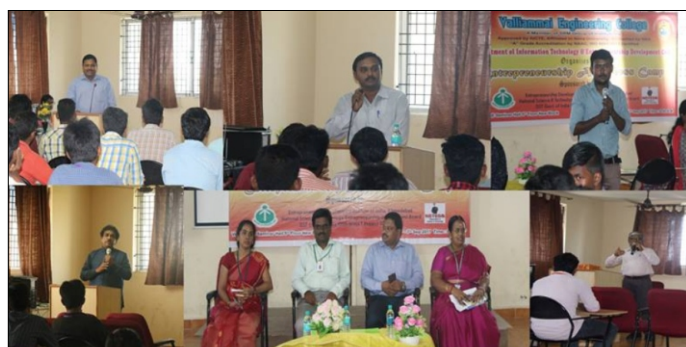
Entrepreneurship Awareness Camp sponsored by Entrepreneurship Development Institute of India

A three day Entrepreneurship Awareness Camp sponsored by the 'Entrepreneurship Development Institute of India (EDI), Ahmedabad' was organized from 05.09.17 to 07.09.17.