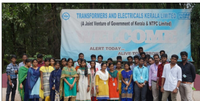
Industrial Visit to Transformers and Electricals Kerala Ltd., Kerala

(i) Kondaas Automation Pvt Ltd., (ii) Transformers and Electricals Kerala Limited (iii) Traco Cable Company Limited Kerala, and (iv) G.D Naidu Museum, Coimbatore.