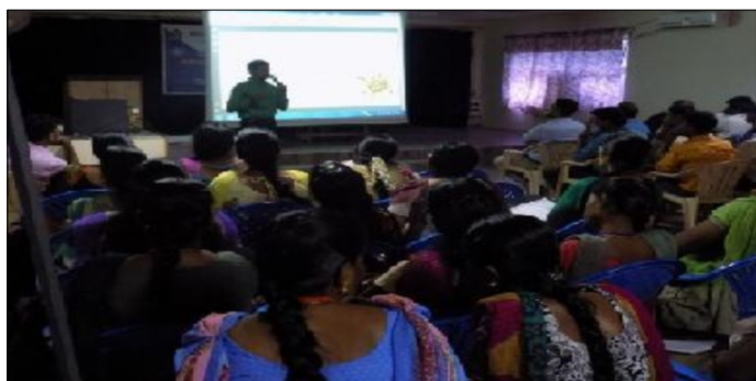
Expert Lecture on the 'Web Services and its Applications'

The Chief Guest explained the fundamentals of the Web services. He identified the components of Web services and their needs to develop Service Oriented Applications and Enterprise Applications. He showed the sample Web services applications which were developed under various platforms and runtime environments. He also explained the importance of the web applications and their real time usage.