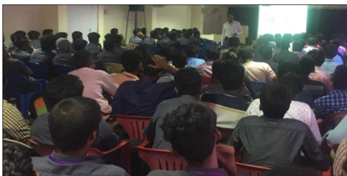
Guest Lecture on the 'Industrial Applications of Fluid Mechanics'