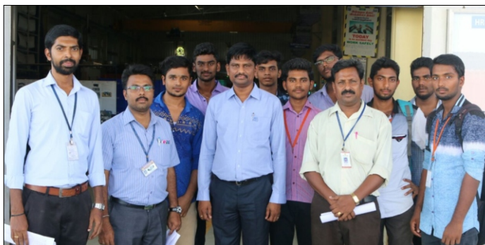
Industrial visit to 'Ms.Abhijeet Arihant Auto Plast Pvt. Ltd'

government and society'. He added up points on the reality of entrepreneurship and the adventure in entrepreneurship. In the afternoon session, the participants along with three Faculty members went on an industrial visit to Ms.Abhijeet Arihant Auto Plast Pvt. Ltd.