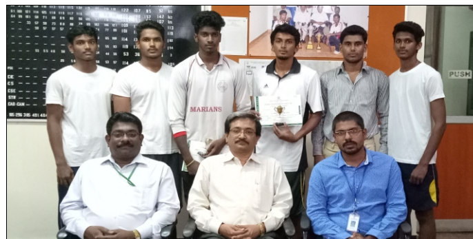
VEC Handball Team won Runners-up in Anna University Zone IV Tournament during the Academic Year 2017-18