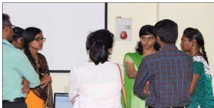
'Mini Project Expo 2017'