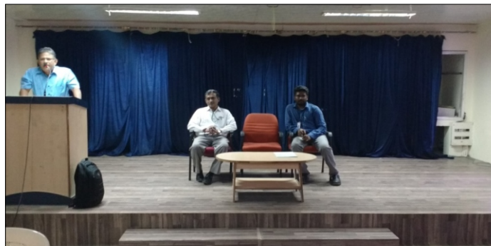
Guest Lecture on 'Emerging Trends in Power Plant Engineering'

selection, fuel and combustion, binary vapour power cycles, methods to improve the efficiency of cycles, Mean temperature differences, biomass gasification technology, microbial fuel cell technology, load curves, high, low and medium sized power plants, power plant grid, plant management systems, performance indicators.