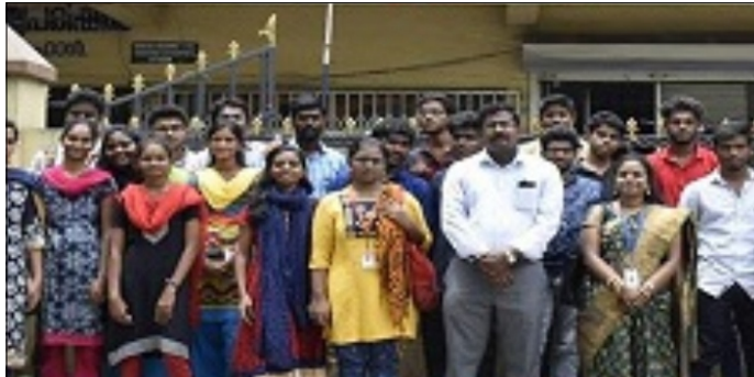
Industrial Visit to Kochi

The students of second year CSE-2 went on a one day field study related to the Environmental Science and Welfare to Potheri hill on 6 th September 2017.