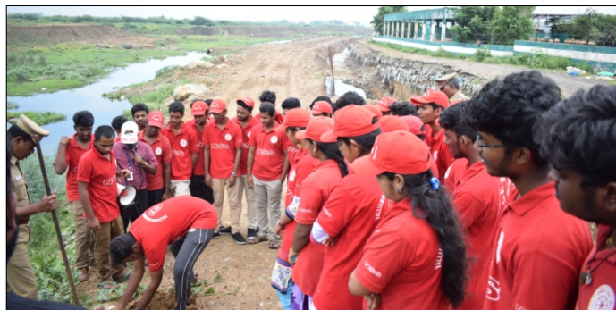
Seed Ball Planting