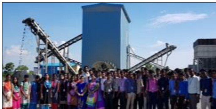
Three day 'Entrepreneurship Awareness Camp (EAC)

Ahmedabad, NST Entrepreneurship Development Board, DST, Govt. of India, DST NIMAT Project 2017-18 scheme for the Science & Technology and Diploma students during 11 th to 13 th September 2017. The main objectives of this camp was to explore the possible business opportunities and create all necessary awareness to start an SSI Unit as per the Government procedures to the young students of Science & Technology and Diploma disciplines.