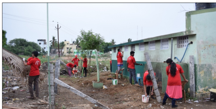
'Swachhta' (cleanliness) of our motherland

On August 1 st , the NSS unit of VEC set out with a broom and contributed towards this noble task. As a part of the