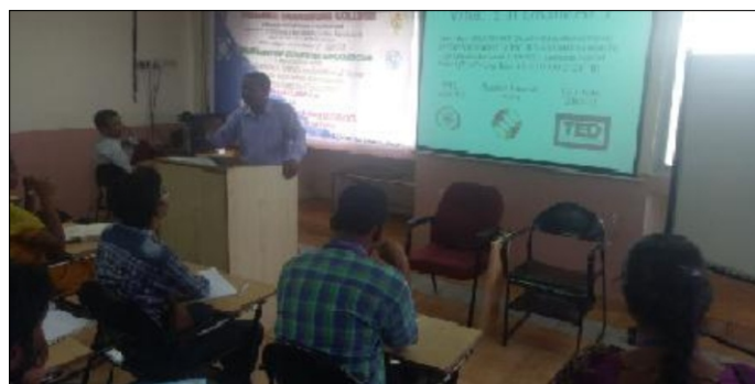
Expert Lecture on 'Virtual Class Rooms Using DIGIMAT Digital Learning Platform'

A one day Expert Lecture on 'Virtual Class Rooms Using DIGIMAT Digital Learning Platform' was organized by the Dept of Computer Applications in association with VEC-CSI Students Chapter, ICT Academy of Tamilnadu (ICTACT)