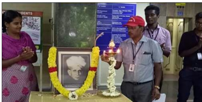
Engineers' Day Celebrations at VEC

The Engineers' Day was celebrated to appreciate the contributions of Bharat Ratna Mokshagundam Visvesvaraya who was born on September 15. India has marked September 15 as the National Engineers' Day.