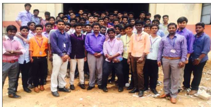
An industrial visit to K Tech Agro Pvt. Ltd., Thirumullaivoyal

The Second Year, Section 1 students went on an industrial visit to K Tech Agro Pvt. Ltd., Thirumullaivoyal, Chennai on 04.08.2017. A group of 70 students accompanied by two Faculty members. The students were taken to the various sections of the firm such as Manufacturing section, Quality Inspection section and the Assembly section in which the components for the pumps and motors are manufactured, assembled and inspected for quality checks.