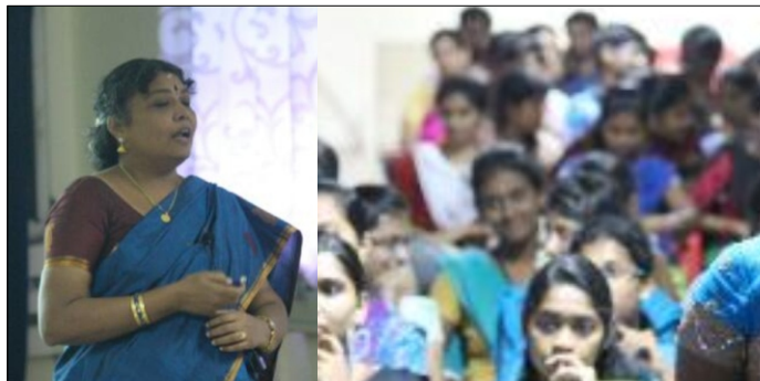
Guest Lecture on 'Integrated Water Resource Management'