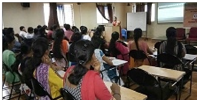
Workshop on the 'Machine Learning'