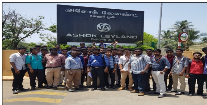
An Industrial visit to Ashok Leyland, Ennore

Third year Section- 1 students went on an industrial visit to Ashok Leyland, Ennore on 27 th July, 2017. The main objective of the visit was to make students aware of how various activities related to the manufacturing activities are carried out in a company and give them the feel of production activities. First, the students were taken to the engine assembly section where they explained about Hino Engine, Combining high-pressure Common Rail Fuel Injection, Variable Geometry Turbocharger design and cooled EGR for emission control to optimize the air/fuel mixture across the entire speed range of our engines.