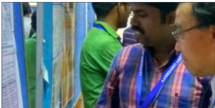
International Conference on Nanoscience and Nanotechnology (ICONN 2017)

In the 4 th International Conference on Nanoscience and Nanotechnology (ICONN 2017) organized at SRM University during 9-11 August 2017, the Staff noted below presented papers.