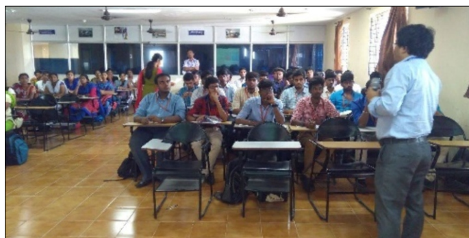
Workshop on the 'Nano Computing'