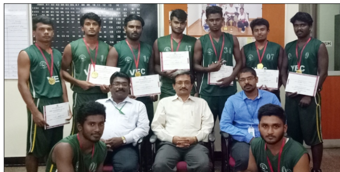
VEC Basketball Team won first place (4th Consecutive Winner) in Anna University Zone IV Tournament - 2017-18

In the Anna University Badminton for men conducted at Sri Sairam Engineering College on 19 th September and 20 th September 2017, our VEC Team won the third place. The following students were the players.