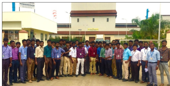
Industrial Visit to 'Madras Engineering Industries Pvt. Ltd'

An industrial visit was arranged to 'Madras Engineering Industries Pvt. Ltd' on 25.09.2017 for the Final year Section I students. The various units in the industry like warehouse, furnace section, core section, moulding unit, moulding sand section and fettling section were explained.