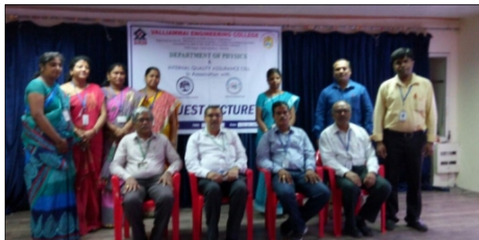
Guest lecture 'Recent Trends in Crystal Growth'