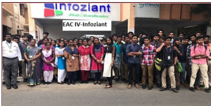
Entrepreneurship Awareness Camp (EAC) at Stigmata Techno Solutions and Infoziant

The students of Third year CSE-1 went on a 2 day Industrial Visit to four companies such as Day 1 Chipsoft Tech Systems and Watts Electronics, Day 2-Spectrum Softtech Solutions and Dimind Innovations (Info Park) at Kochi, Kerala on 25.08.17 and 26.08.17.