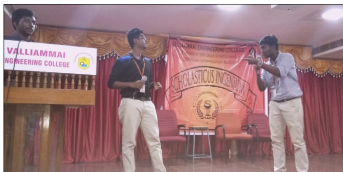
Students participation in an event of 'Scholastic Ingenium'

Accenture visited our College for recruitment on 7 th September 2017 and 148 students from Mech, MCA, IT, EIE, EEE, ECE, CSE and Civil Depts got selected.