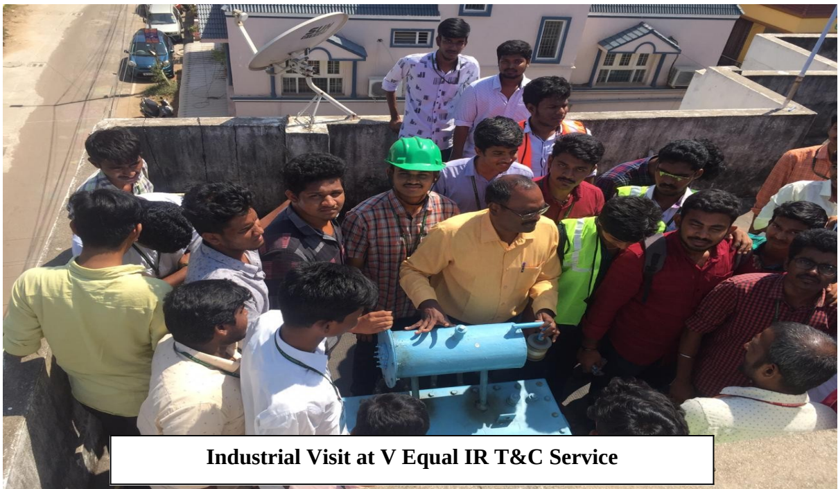
Industrial Visit at V Equal IR T&C Service