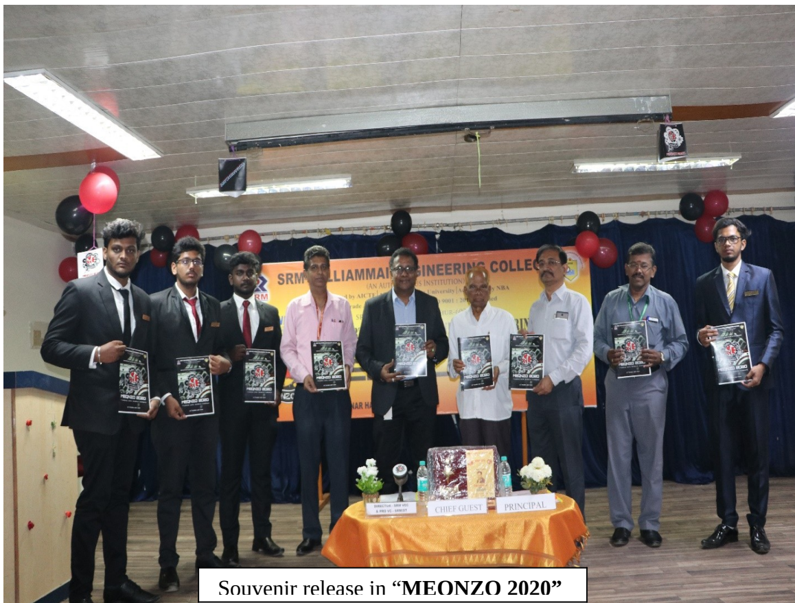
Souvenir release in "MEONZO 2020"