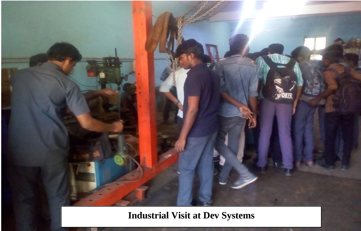
Industrial Visit at Dev Systems