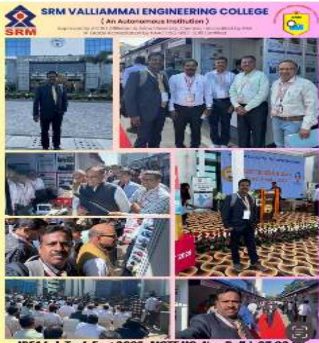
IDEA Lab Tech Fest 2025, AICTE NQ, NewDelhi, 07.03.25

11. On February 21, 2025, the Department of Artificial Intelligence and Data Science organized an industrial visit to the Heartfulness Center in Manapakkam, Chennai, for second-year students. The visit offered students a unique opportunity to explore the integration of mindfulness practices with technology, promoting holistic development alongside academic learning.